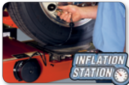
Integrated Inflation Reels (-IS models) Automatically fills or bleeds each tire.