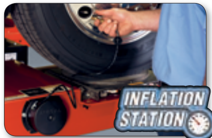
Integrated Inflation Reels (-IS models) Automatically fills or bleeds each tire.