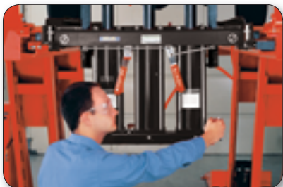
Swing Air-Jack, 133-83-1 9,000 lb. (4082 kg) Capacity