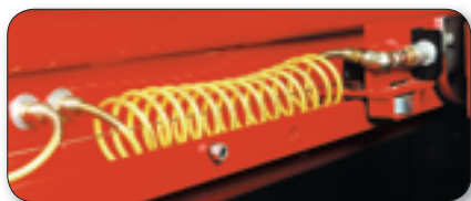
Air Line Kit Provides an air source at the front and rear for jacks and air tools.